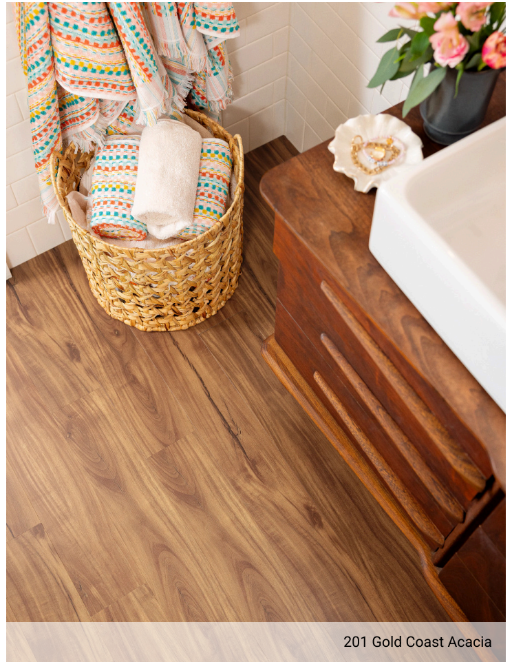
201 Gold Coast Acacia