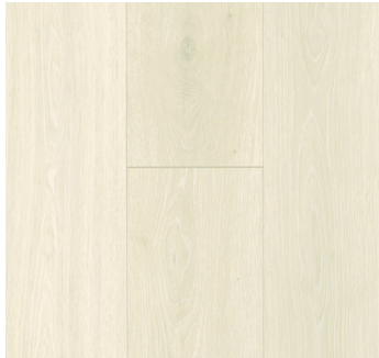
GULF SAND | 05W