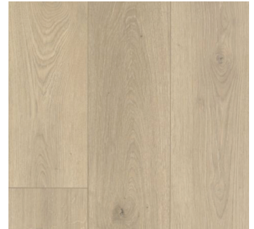
SAIL CLOTH | 08W