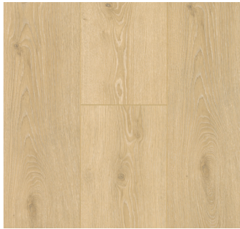
SAND DUNE | 01W

Covers all pets, all accidents, all the time.