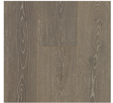
BOATHOUSE BROWN | 04W