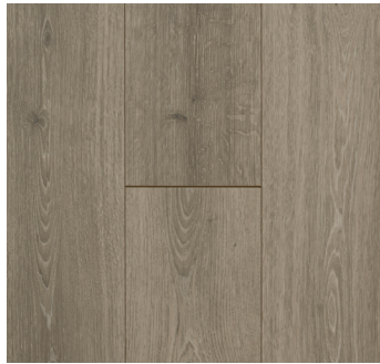
BEACHWOOD | 02W