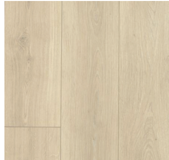
BLEACHED LINEN | 07W