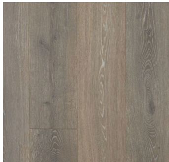
WICKER | 10W