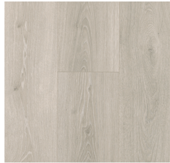
SILVER SHADOW | 03W