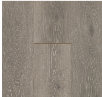
GRAPHITE | 06W