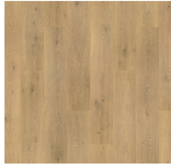
TULIP SHELL OAK | 248