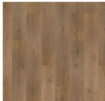
DOCKSIDE OAK | 852