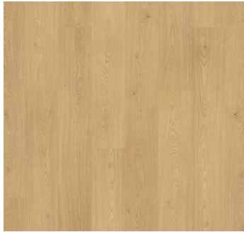
GOLDEN HOUR OAK | 122

Maximum waterproof protection for wet and steam mopping.