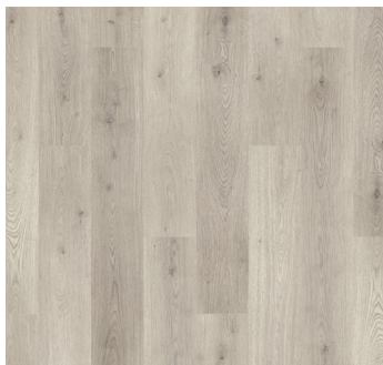
SUNSHOWER OAK | 935