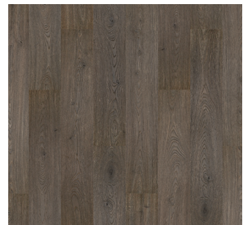
ANCHOR OAK | 988