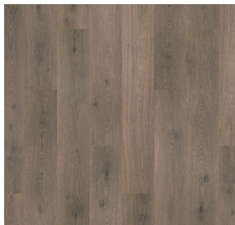
CLOUDY OAK | 958