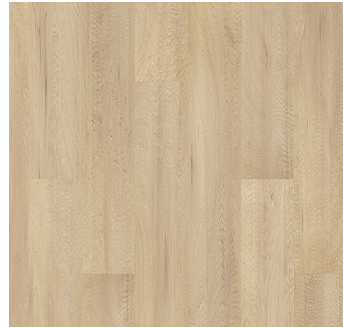
DUSTY TRAIL OAK | 469