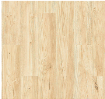
SAND CHESTNUT | 423

Lifetime scratch protection for your flooring.