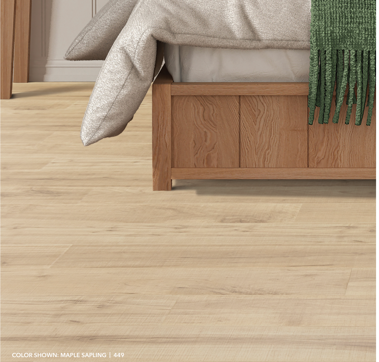
COLOR SHOWN: MAPLE SAPLING | 449