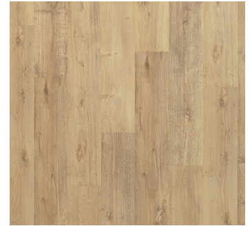
FALLEN LEAF OAK | 468