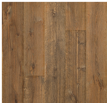
NATURE WALK OAK | 258