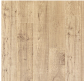
MAPLE SAPLING | 449