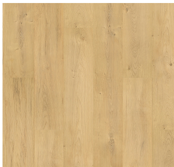
WHEAT FIELD OAK | 142