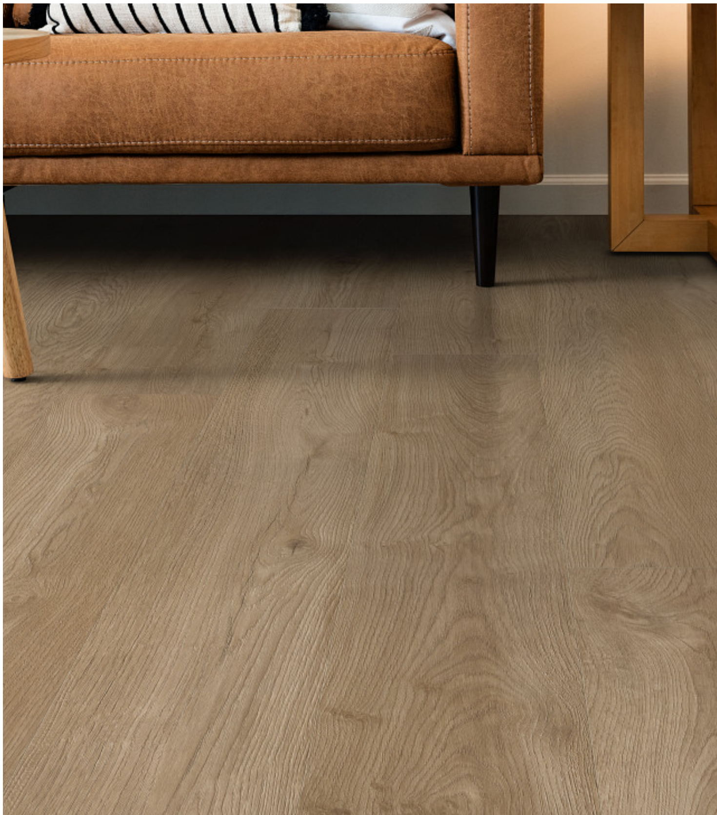
7302 Wingback Brown