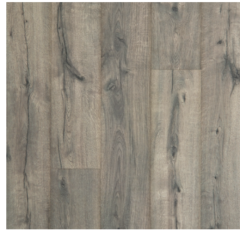
LUNAR OAK | 03