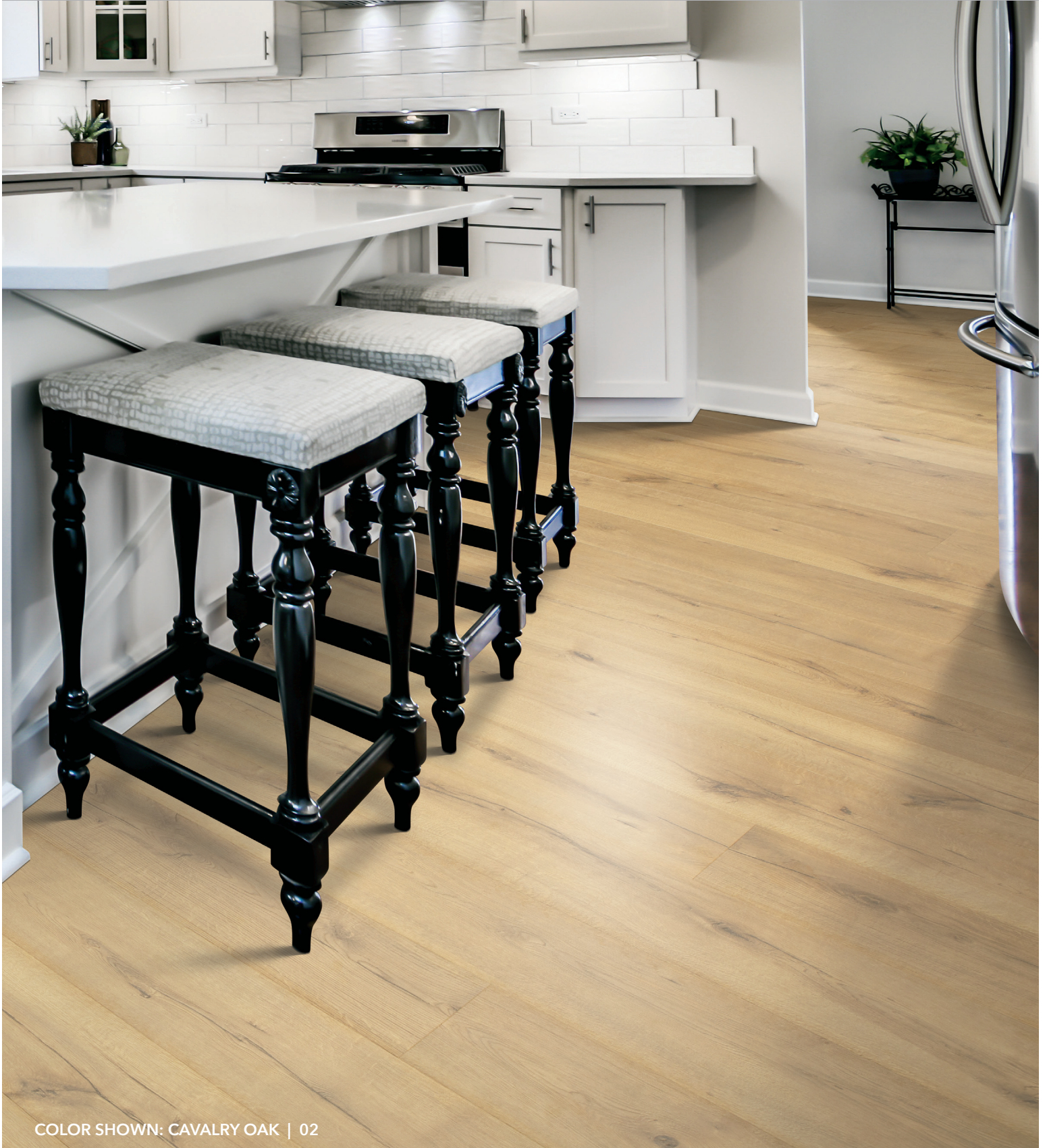
COLOR SHOWN: CAVALRY OAK | 02