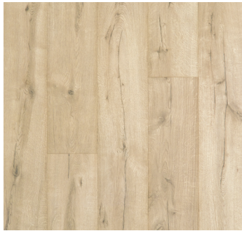
SAND PEARL OAK | 01

Maximum waterproof protection for wet and steam mopping.