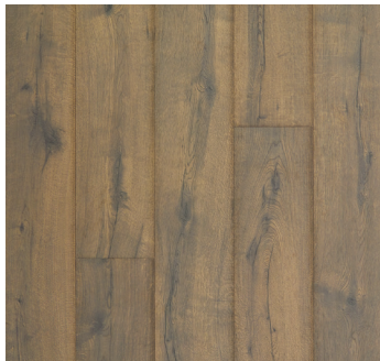
ANTIQUITIES OAK | 05