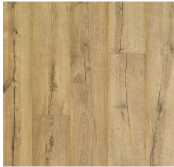
CAVALRY OAK | 02