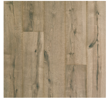
TRINKET OAK | 04