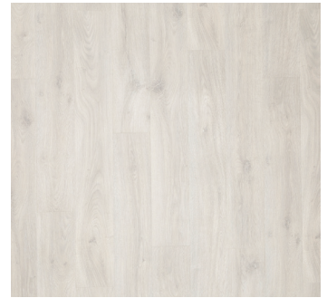
WHITEWASH OAK | 04