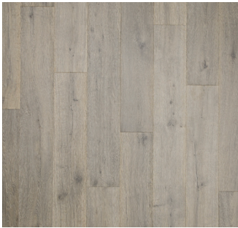
STONEFIRE OAK | 01

Maximum waterproof protection for wet and steam mopping.