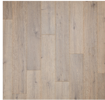
VINTAGE VILLA OAK | 03