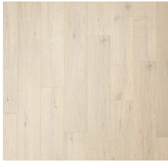
TERRACE OAK | 02