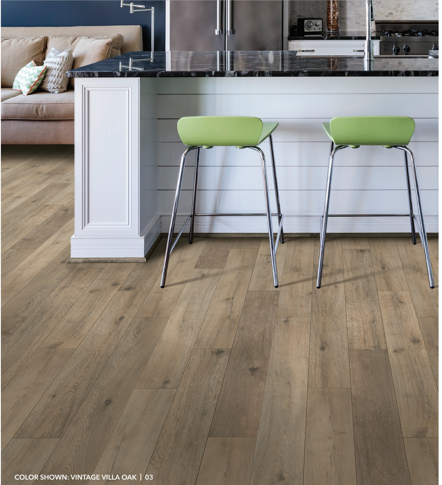
COLOR SHOWN: VINTAGE VILLA OAK | 03